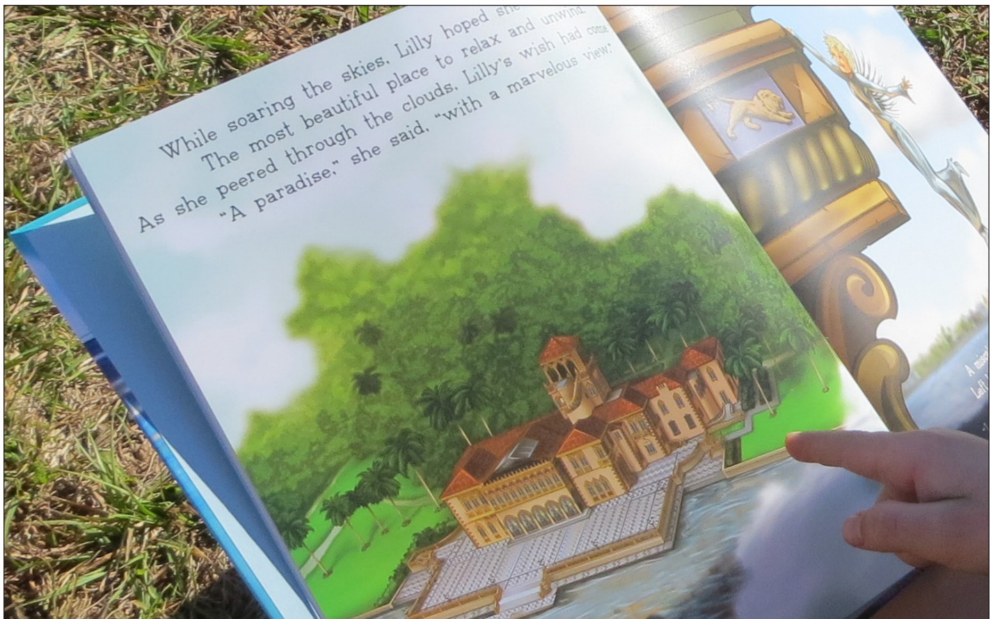
A young reader peruses one of Julie Woik's "Lilly the Lash" books for children.

There are of course, millions of creative people doing millions of magnificent things all around the world every single day, and there’s a story to accompany each and every one of them. I’m no exception. However, what I’ve come to discover is that people aren’t only enamored by the tantalizing tale